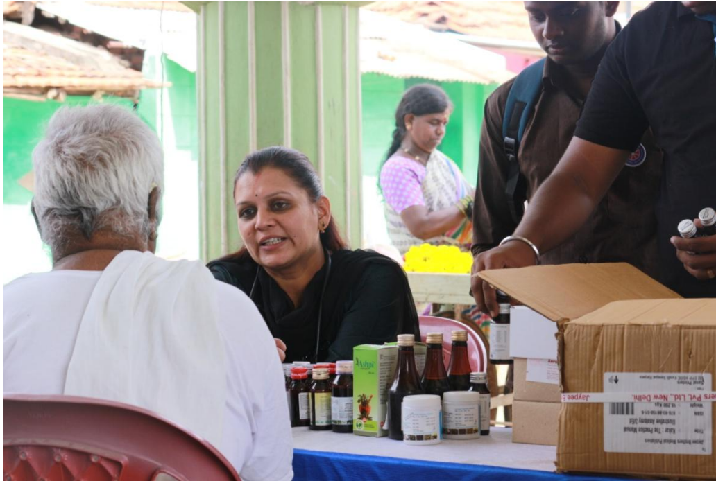
Ayurvedic Health Check up by Doctors of JSS Ayurveda College and Hospital