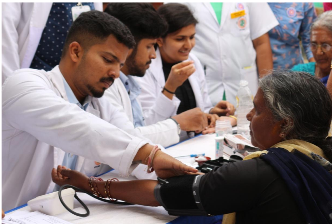
Health screening camp conducted by Pharmacy Practice Dept. JSSCP, Mysuru