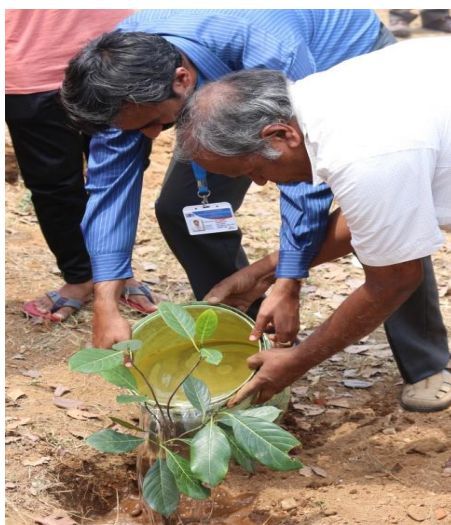
Sapling of Plants by Staff and Students