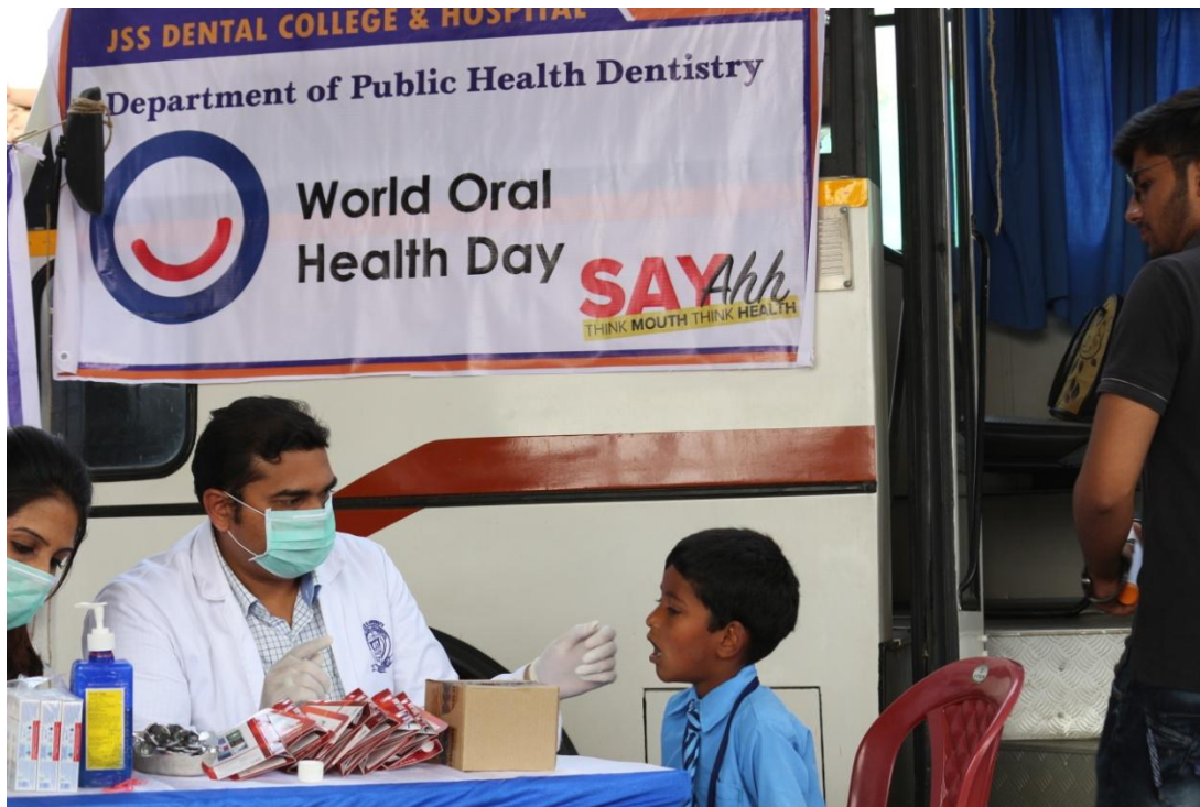
Dental Health Checkup by JSS Dental College and Hospital