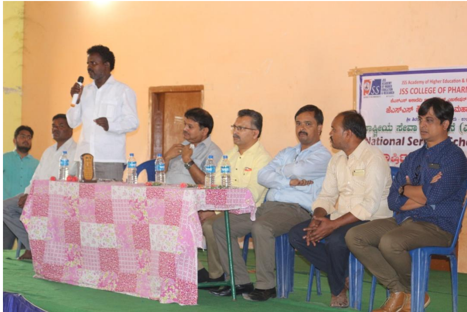
Valedictory function at Bhugathahalli convention hall on 21-03-2018