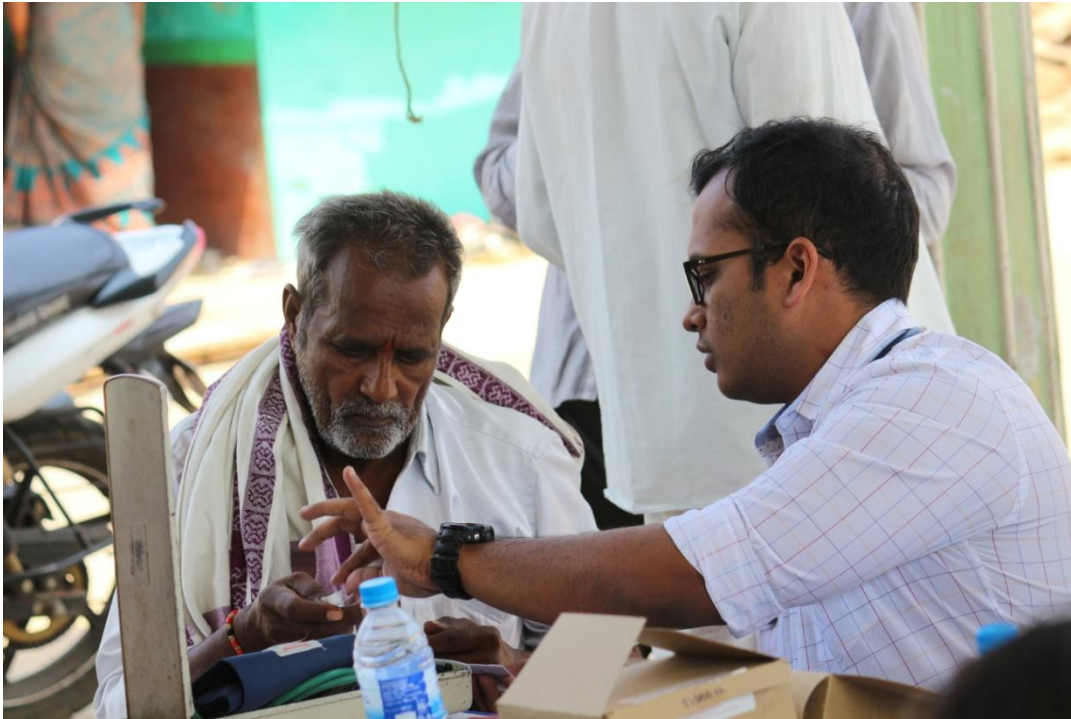
Medical Health Checkup by JSS Medical College and Hospital Doctors