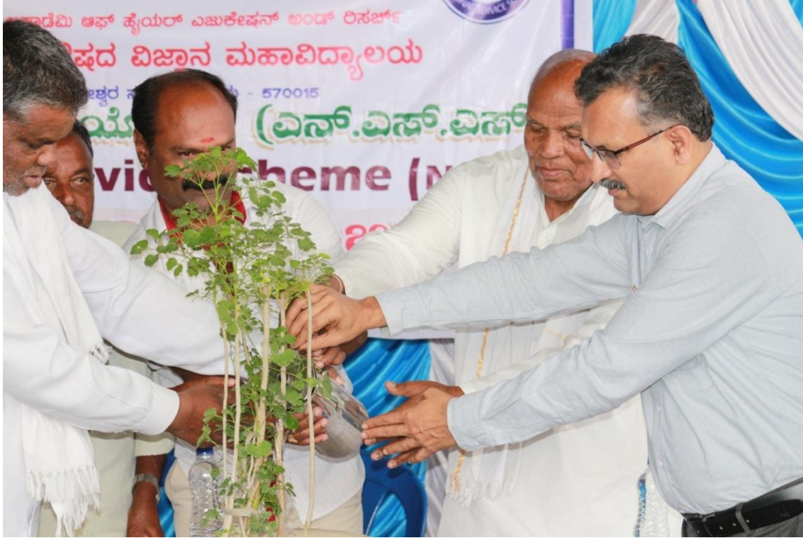
NSS Annual Special camp 2017-18 Inauguration ceremony