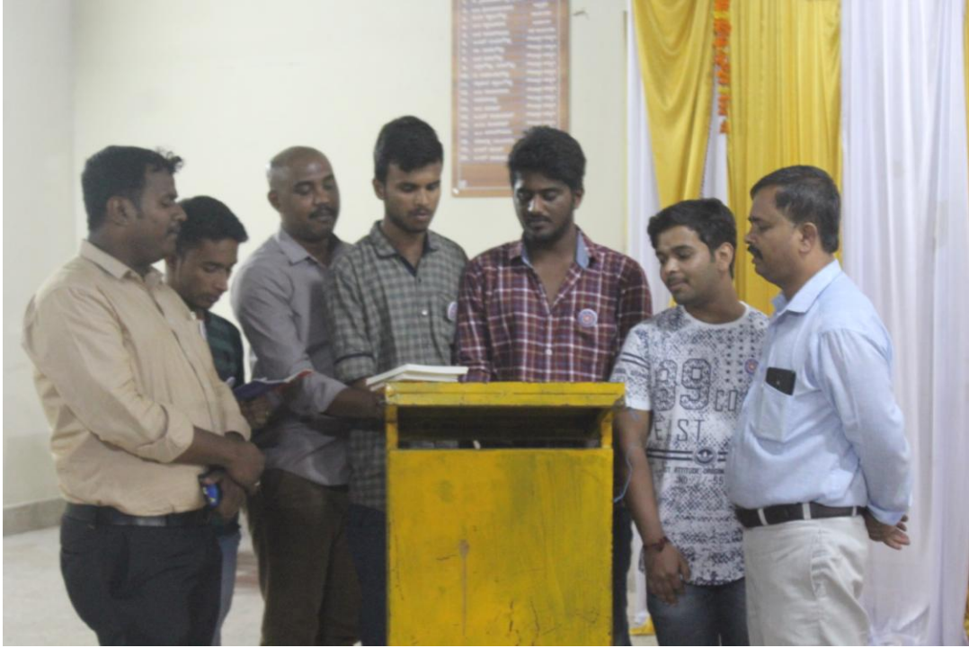
NSS Song being sung in chorus